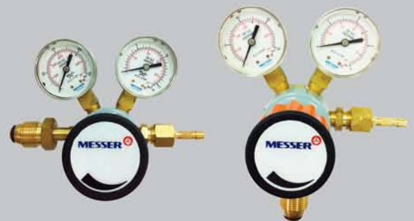
TYPHOON series B