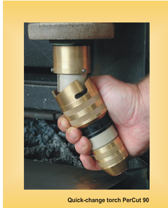
Quick-change torch PerCut 90