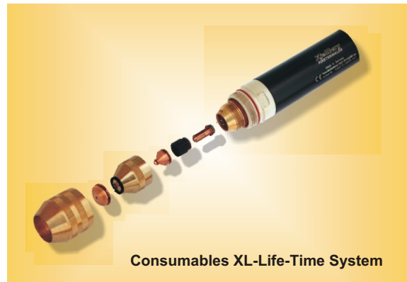
Consumables XL-Life-Time System

The high performance capacity of the plasma torch PerCut 80 ensures in connection with the heavy duty XL-Life-Time system and its longevity of cathodes and nozzles (up to 1,200 piercings with edge squareness still below 3°) lowest costs on consumables and minimized downtimes . The technical conditions for the high productivity of the plasma cutting process are optimized operational parts of the beam generation system interacting with microprocessor controlled sequences.