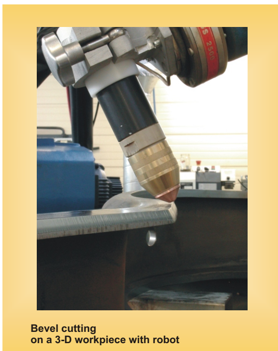
Bevel cutting on a 3-D workpiece with robot

For the moment this unique plasma cutting unit with HiFocus PLUS technology will be offered in this performance class for the plasma gases oxygen and air. Because of the outstanding price-performance ratio especially the medium sized industry now is in the position to compete on the market with high-class cutting work.