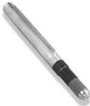
MAX100D machine torch